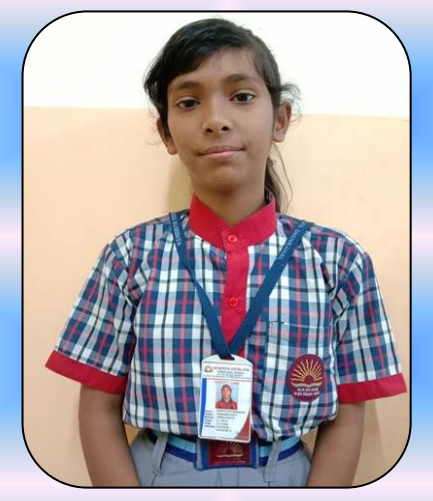
SUPRAGNYA V-A (DANCE)