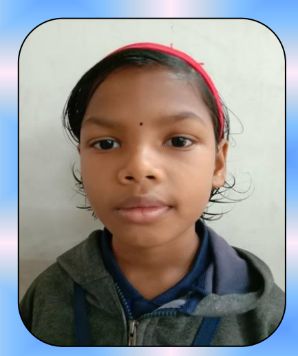
SIPRA SWAYAM PRAVA III-B (HANDWRITING)