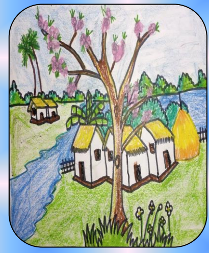
Subhashree Chakraborty V-B