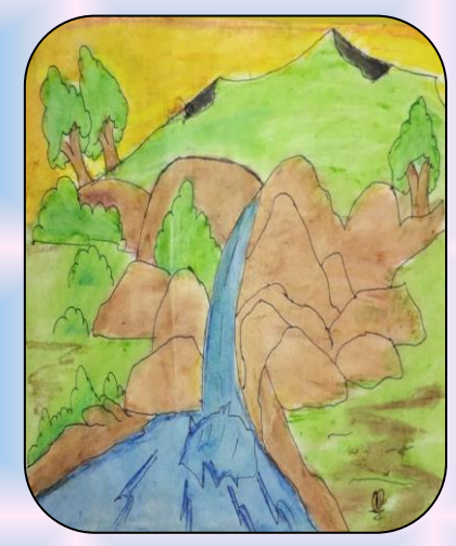
Smruti Sourav Nayak IV-A