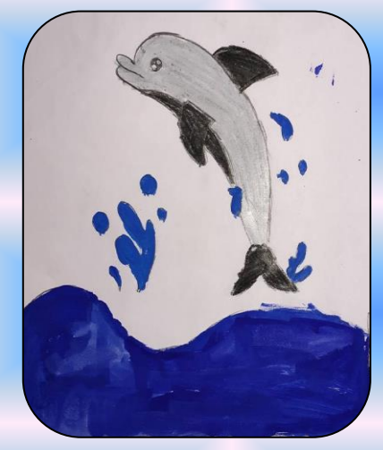
Souravi Das II-A