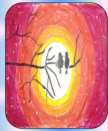
Afrin Tarafdar V-B