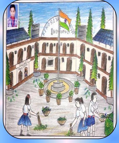
Satish Rout IV-A