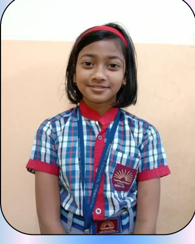
B.GLENESH IV-A (DRAWING)